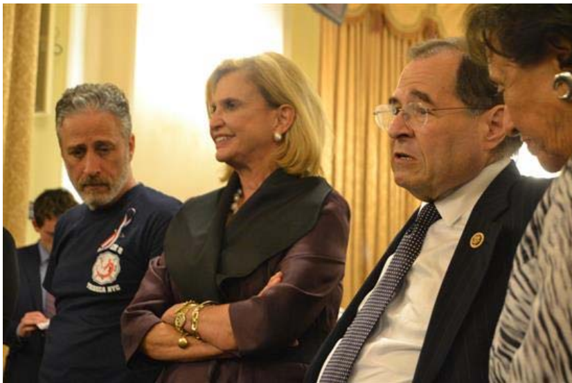
Congressman Jerrold Nadler, Comedian Jon Stewart and Congresswoman Carolyn Maloney discuss the James Zadroga 9/11 Health and Compensation Act.

On Wednesday, I was joined by Jon Stewart, former host of Comedy Central's The Daily Show , to push for the reauthorization of the James Zadroga 9/11 Health and Compensation Act, which provides health coverage for survivors and first responders who were injured on 9/11.