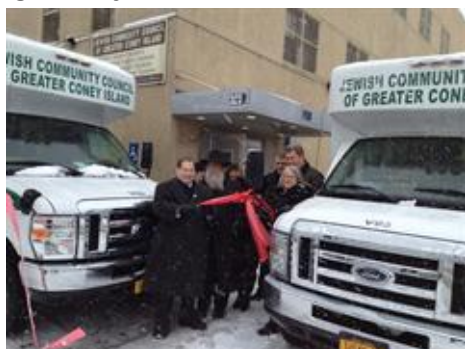
Rep. Nadler helped secure funding for the Jewish Community Council of Greater Coney Island for two wheelchair-accessible buses for seniors in southern Brooklyn.

Last month, I was honored to receive recognition from the Jewish Community Council of Greater Coney Island (JCCGCI) for my work on behalf of the communities of southern Brooklyn for the past 20 years as their representative in Congress. JCCGCI does important work for the people of Brooklyn, and I am pleased to have helped them obtain federal funds to purchase two wheelchair-accessible buses for the transport of senior citizens. These two 16-passenger buses serve seniors in Coney Island, Sea Gate, Brighton Beach, Midwood, and other parts of Brooklyn and, after the devastation of Hurricane Sandy, have been used to transport hundreds of seniors to obtain food and supplies that are desperately needed.