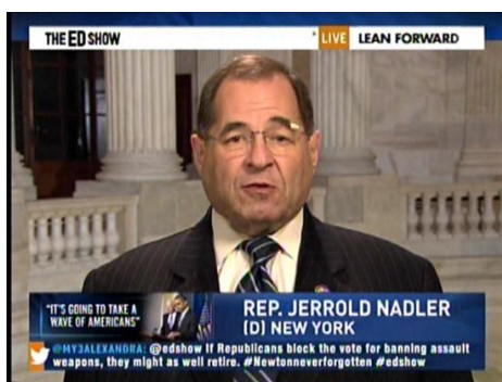
Congressman Nadler discusses efforts to remove weapons of war from the streets. Watch the video.

Like every parent, I was horrified by the loss of so much innocent life in the Newtown shooting on December 14. For too long, we have watched the rising numbers of children and other innocent Americans killed by guns without any meaningful response from the federal government. Enough is enough. Parents dropping their kids off at school should not have to worry about whether those kids will make it home for dinner. And parents in communities plagued by drugs and violence should not have to worry about whether their son or daughter will be hit by the next stray bullet. Now is the time to address the nationwide epidemic of gun violence.