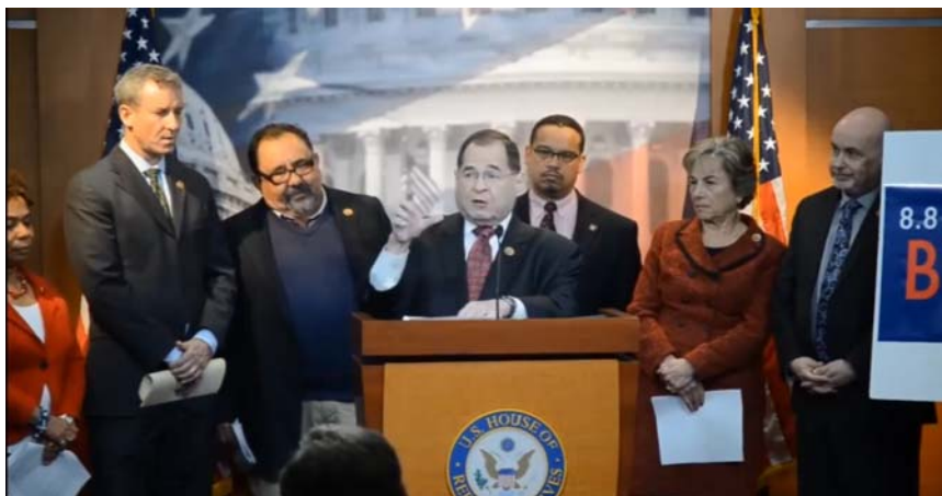
Congressman Jerrold Nadler (NY-10) introduces the Congressional

Restoring fairness to the American economy means helping those in need, especially the most vulnerable among us. The "Better Off" Budget would restore full funding to food stamp programs and would ensure the 40 million Americans who rely on these benefits are not suddenly choosing between paying for housing, buying much-needed medication, and putting food on the table. This budget would help our seniors by strengthening Medicare and Medicaid and preventing any cuts in benefits and services.